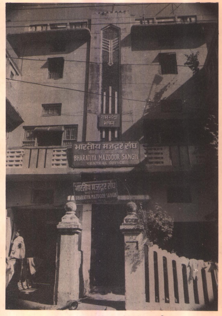
भा.म. संघ का दिल्ली स्थित केन्द्रीय <mark>कार्यालय</mark> Central Head Quarters of B.M.S. at New Delhi