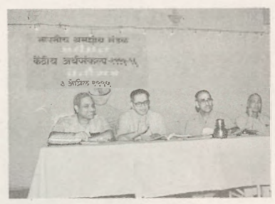
Seminar on 1995-96 Central Annual Budget

The central and state Governments "Annual Budgets, to a large extent influence the economic, industrial and social life of this country. The "Mandal arranges seminars for prebudget and post-budget critical appraisal of economic conditions and Budget provisions for the benefit of the social workers especially those connected with labour organizations.