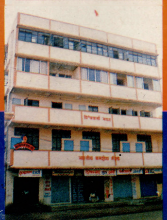
Building of Shram Shodh Mandal