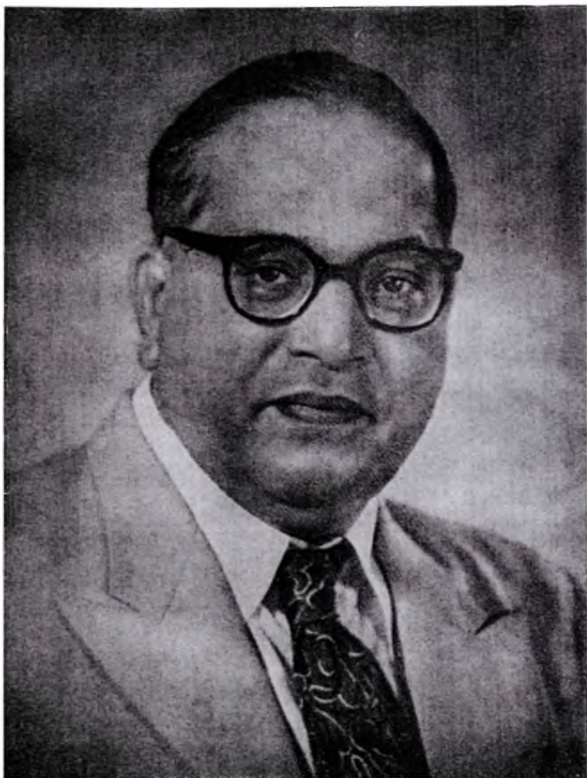
Dr. BABASAHEB AMBEDKAR