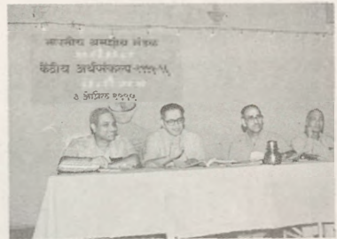
Seminar on 1995-96 Central Annual Budget

The central and state Governments "Annual Budgets, to a large extent influence the economic, industrial and social life of this country. The "Mandal arranges seminars for pre-budget and post-budget critical appraisal of economic conditions and Budget provisions for the benefit of the social workers especially those connected with labour organizations.