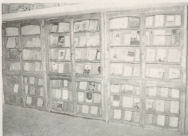
Picture of Reference Library

The "Mandal" is continuously making research and survey relating to Industrial Relations. It holds joint Seminars of the Representatives of Workers, Management and the Government. It conducts