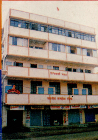
Building of Shram Shodh Mandal