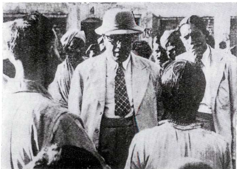
The Hon'ble Dr. B. R. Ambedkar talking to Colliery Labour during his tour of Coalmine areas on December 9, 1943.