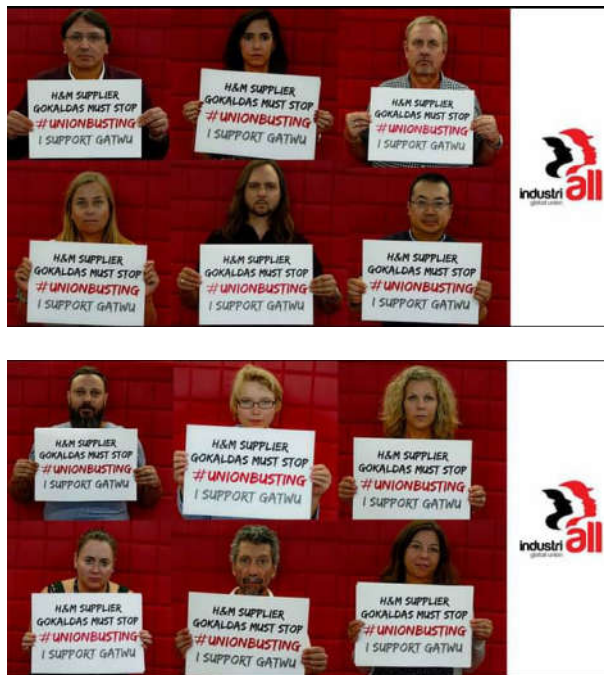
Figure 9: Social Media Campaign by IndustriALL

The Global Union IndustriALL has condemned Gokaldas Exports for what it calls as 'union-busting', stating that its 'behaviour violates international labour standards' and has stated that it would be contacting other brands such as C&A, Marks and Spencer, Gap, Adidas, Bestseller who source from Gokaldas Exports' factories. It also initiated a social media campaign, supporting GATWU against the company (see Figure 9). While IndustriALL placed the blame squarely on Gokaldas Exports, NTUI and GATWU have pointed to the ways in which the lay-off was a violation of H&M's commitments in the GFA. In their report at the end of a month of protests, NTUI pointed out