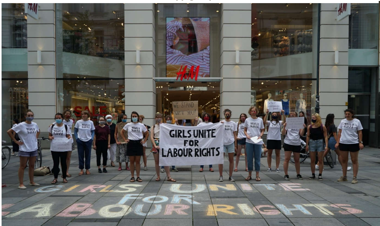
Figure 7: An image showing support for the protests at ECC-2 factory which was shared on the whatsapp group of workers