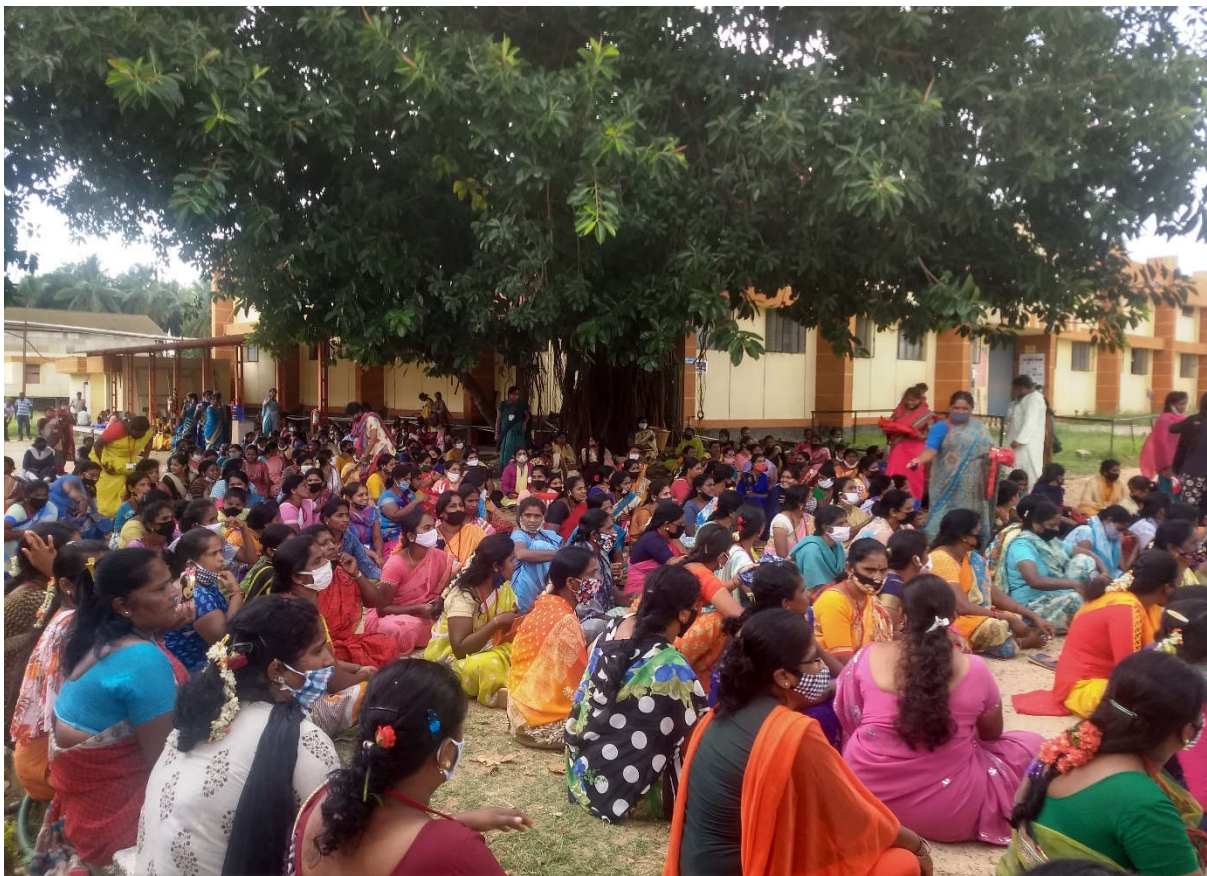
Figure 5: Workers gathering to listen to union leaders and district administration

In any case, as the protests continued to hold strong weeks after the announcement of the lay-off, the management intensified its efforts to break the strike on ground. Where workers