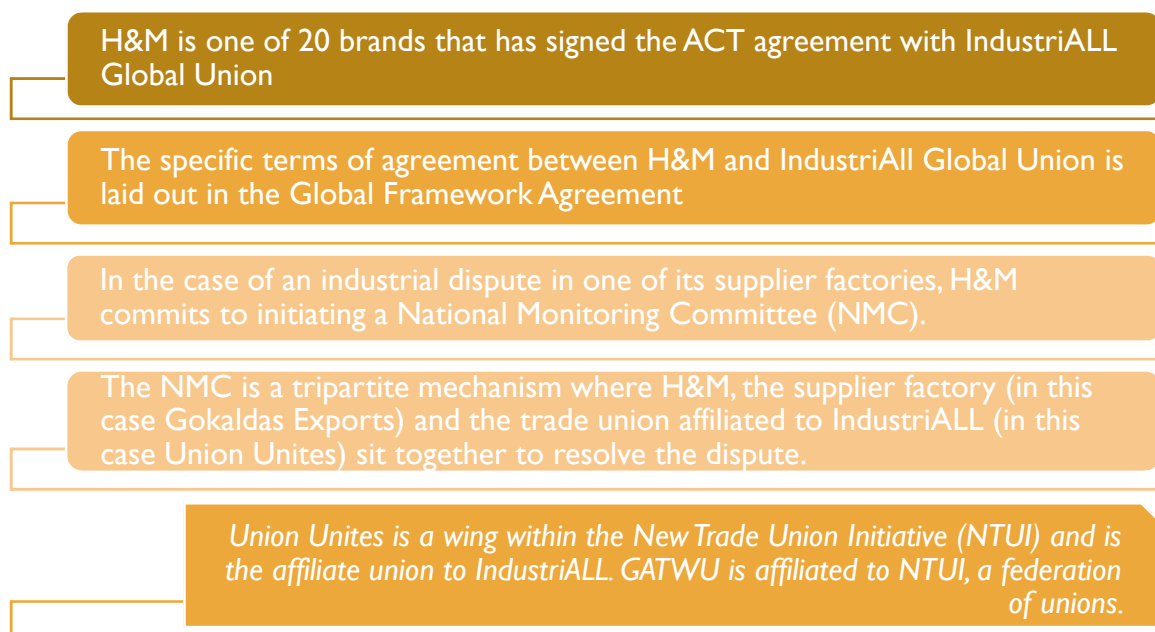
Figure 3: Governance Framework for H&M's commitments to workers in its supplier factories