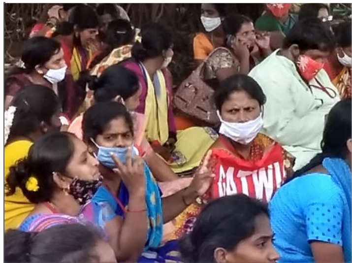
Figure 4: Workers listening to union leaders at the ECC-2 unit

As we spoke to the protesting workers, the Kannada term ' aase ' came up repeatedly, one that translates into something akin to a mix of desire, hope, longing. The aase that these women referred to—a 'good' education for their children, a house of their own, and meagre capital to invest into farming—may have seemed well within their reach when they were earning regular salaries. 'There was a certain courage that I will manage things somehow. I get salary. I can work. With the company around, we felt like there is someone to support us,'