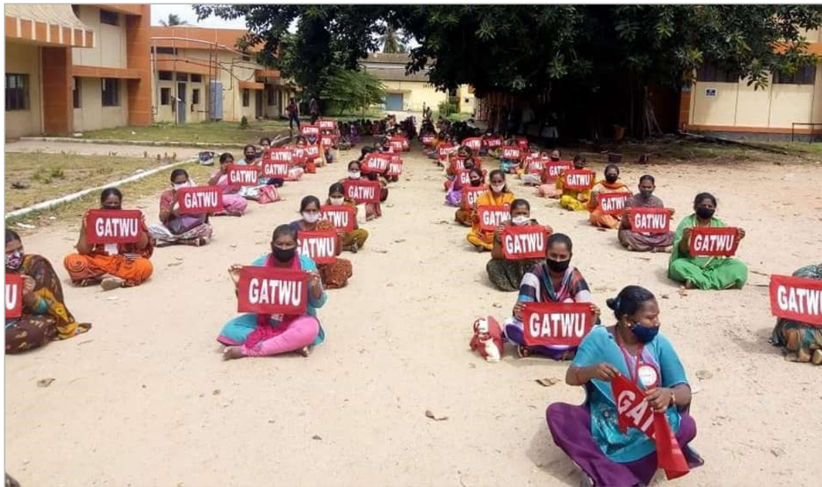
Figure 1: Women workers protesting at ECC-2 unit premises

the stress of watching groups of their co-workers give in to force and resign. For many, protesting meant bearing even more pressure as they battled familial displeasure of their activities. As R. Prathibha, president of GATWU, noted in an interview, such protests are few and far between in the garment industry. This is particularly so in metropolitan centres such as Bangalore where there are a large number of garment factories and finding employment in another factory is not very difficult, she explained. Workers in such urban centres prefer to resign and move onto another factory for employment. 5